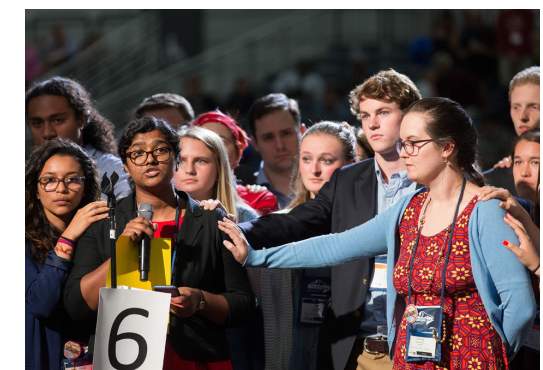
General Conference 2019