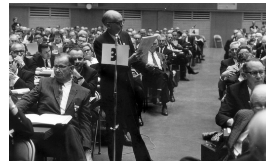
General Conference 1968

We celebrate these changes! When we look back, we can see God at work, slowly leading us forward into faithful service. As you look back at your life and faith, what changes do you see and celebrate?